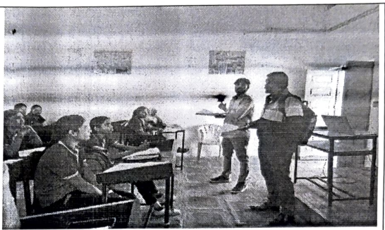
Social Welfare Department, Wardha informed the students about different types of Scholarship granted by Government of India