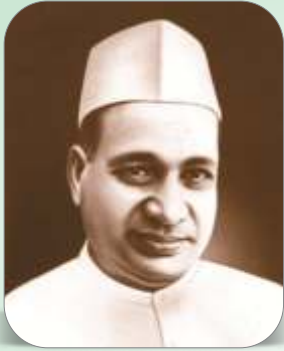
Jamnalal Bajaj (1889-1942)

Shri Jamnalal Bajaj exemplified the qualities as a visionary leader integral to India's freedom struggle and the Bajaj Group. A humanitarian, freedom fighter, and follower of Mahatma Gandhi, Jamnalalji actively contributed to various social causes and the nation's development. He played a key role in cow protection, upliftment of dalits, women's education, promotion of Hindi, Khadi, and village industries. Known for his strict ethical code, he embodied Gandhian principles in all aspects of life. Establishing Shiksha Mandal in 1912 for nation building, he influenced many in the freedom movement.