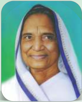
Jankidevi Bajaj (1893 - 1979)

Shri Jamnalal Bajaj exemplified the qualities as a visionary leader integral to India's freedom struggle and the Bajaj Group. A humanitarian, freedom fighter, and follower of Mahatma Gandhi, Jamnalalji actively contributed to various social causes and the nation's development. He played a key role in cow protection, upliftment of dalits, women's education, promotion of Hindi, Khadi, and village industries. Known for his strict ethical code, he embodied Gandhian principles in all aspects of life. Establishing Shiksha Mandal in 1912 for nation building, he influenced many in the freedom movement.