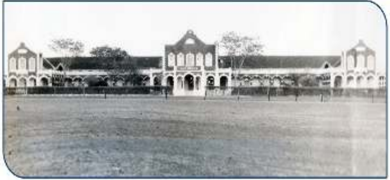
Rechristening Marwadi Vidyalaya as "Navbharat Vidyalaya" for National Integration (1 May 1937)