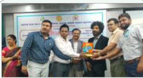
महाराष्ट्र राज्य उच्च व तंत्र शिक्षण विभाग, महाराष्ट्र माहिती तंत्रज्ञान सहाय्यता केंद्र यांच्या संयुक्त विद्यमाने करिअर कट्टा चे विभागीय पुरस्कार वितरण सोहळा २०२५ धनवटे नॅशनल कॉलेज, नागपूर उत्कृष्ट जिल्हास्तरीय महाविद्यालय (वर्धा जिल्हा) प्रथम क्रमांक - बजाज विज्ञान महाविद्यालय, वर्धा.