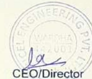
CEO/Director Unicel Engineering PVT. LTD

In recognition of his/her dedication and exemplary performance during the internship, this certificate is awarded as a testament to their commitment to the field of Chemistry