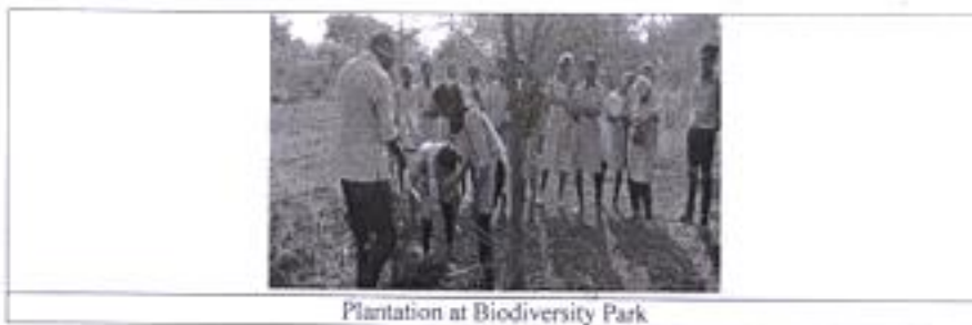
Plantation at Biodiversity Park