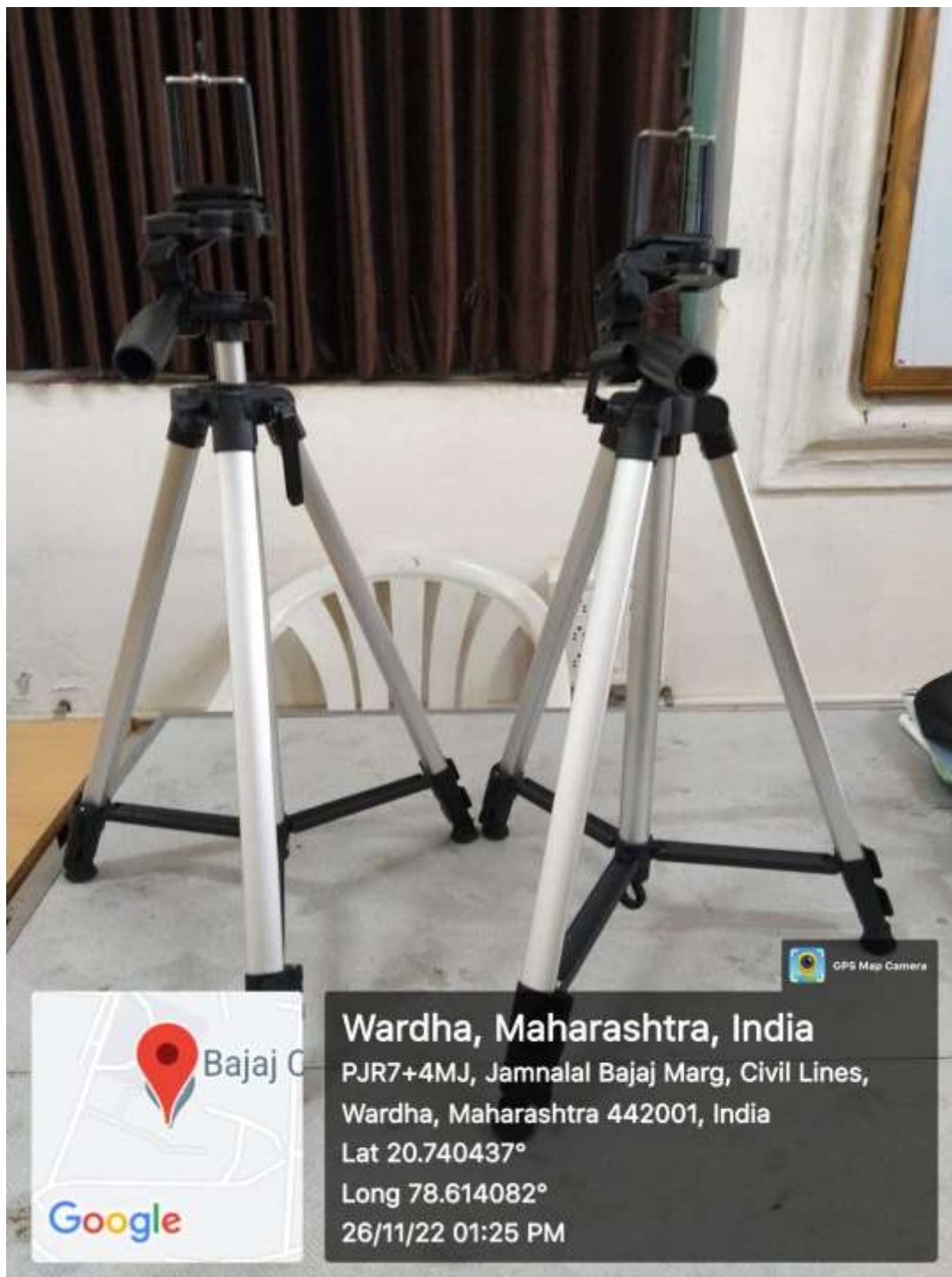
Tripod stand for video capturing