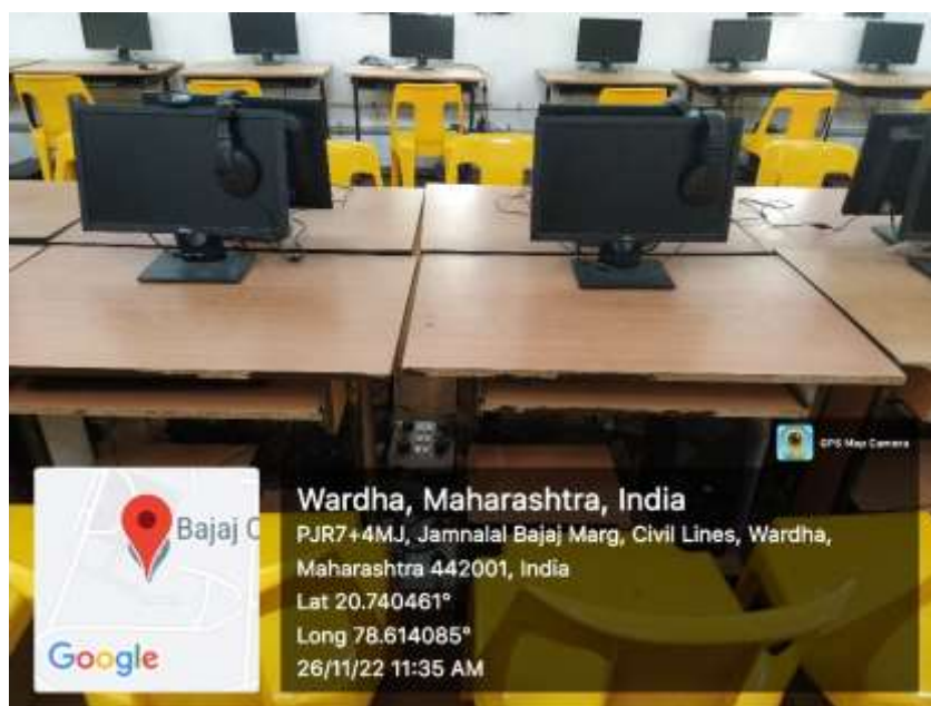
Computers enabled with software for e-content development