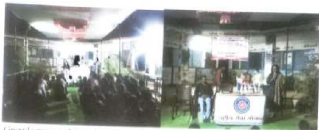
Guest Lecture on Organic fertilizers and its Uses