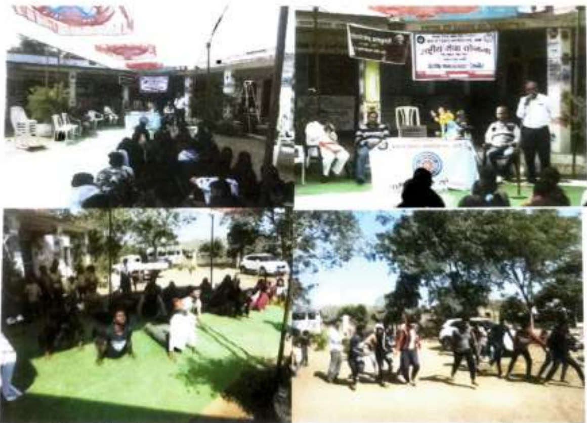
National Youth Day Program