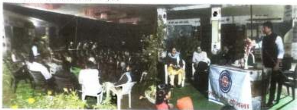
Andhastradha Nirmulan program