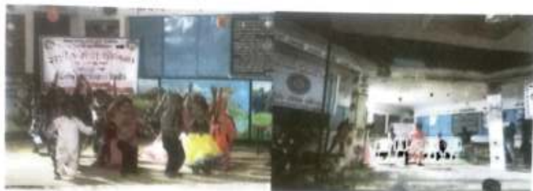
Z. P. Primary School students performance, dance and musical choir