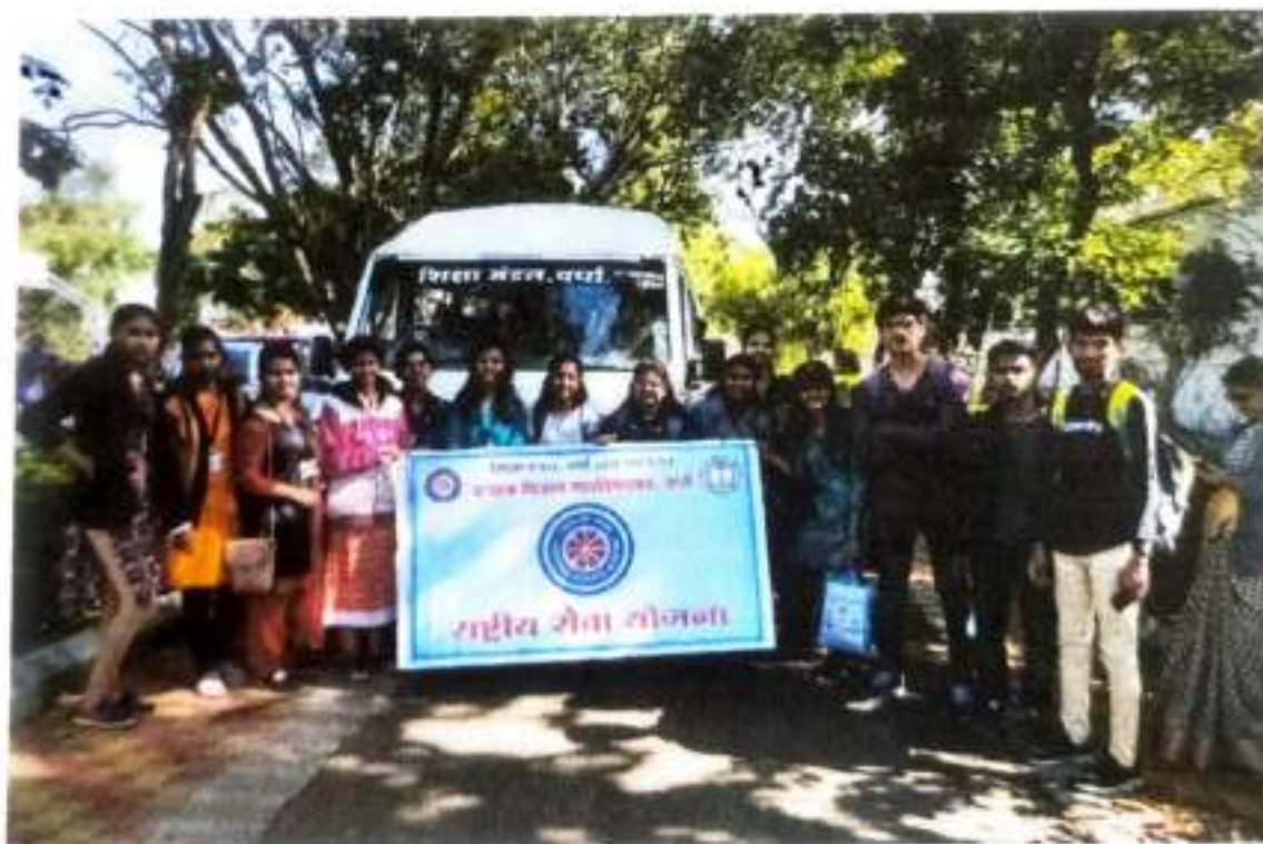
Departure to Amgaon (M)

The day of our departure for the camp finally came, all the volunteers were super excited and enthusiastic about the camp. They were all filled with a spirit of teamwork and sense of responsibility towards society. All of us were excited to reach Amgaon. Our journey began from Bajaj College of Science, Wardha at around 12:00 pm and we reached our destination Amgaon (M) at about 12:45 pm.