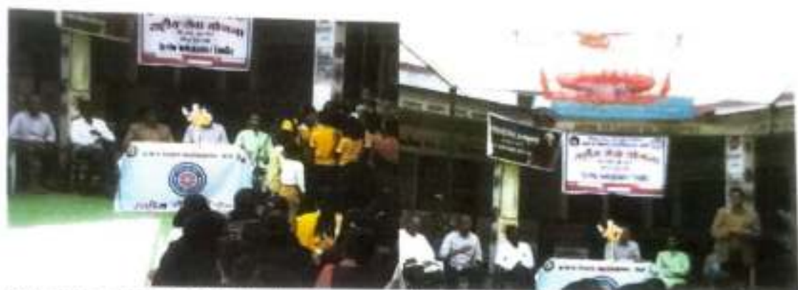
Welcome song by Z. P. School students.