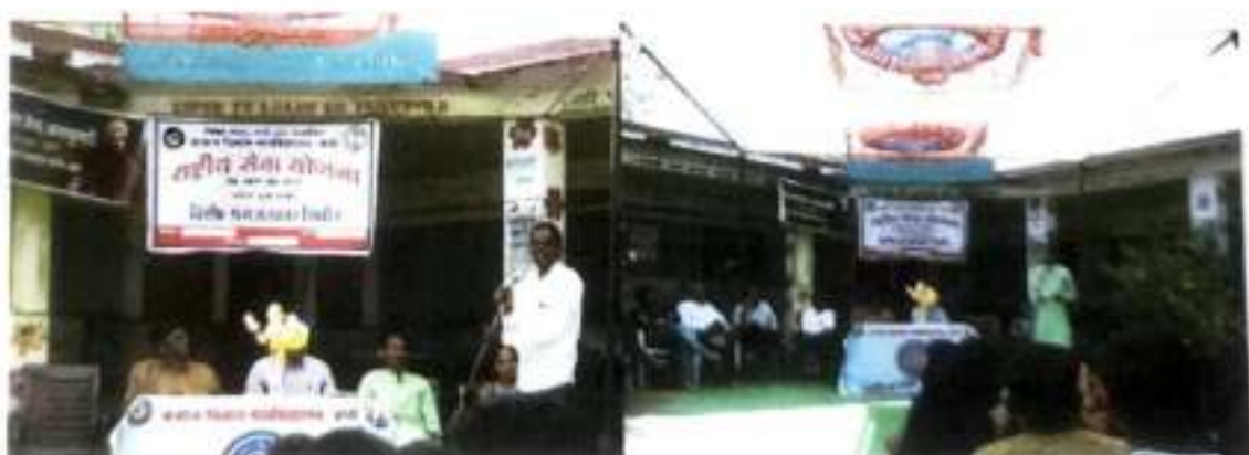
Sarpanch, Amgaon (M)