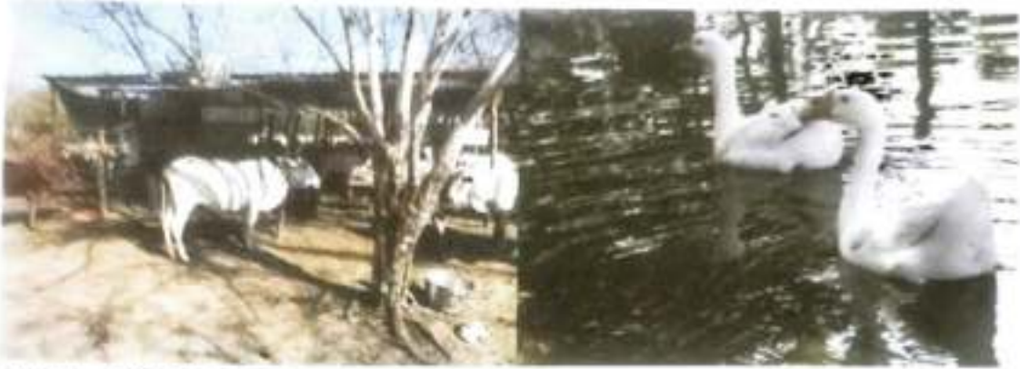
Glimses of Organic farm