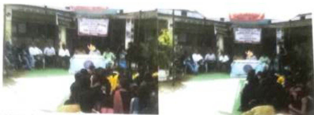
NSS volunteers sharing their experiences

The villagers were grateful to the NSS volunteers and organizers for providing awareness about cleanliness, and also urged to hold the NSS camp every year in the village