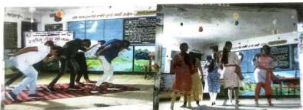
Boys dance performance