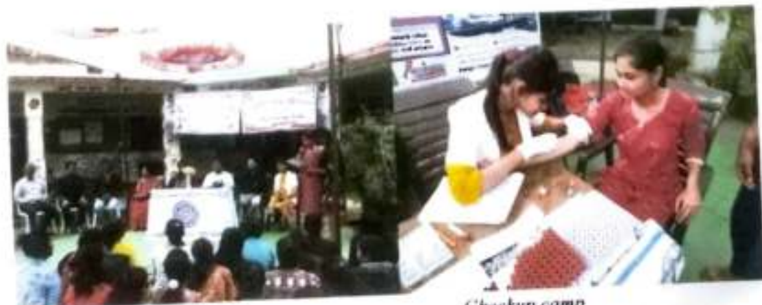
Inauguration of camp.

The afternoon session was the creation of healthy society through community health services. The top most priority was given to free physio treatment, free blood pressure check up to underprivileged rural people. A public announcement was made and door to door communication done by our volunteers to inform people to avail free health services. The event was marked by a "Health Checkup Camp" organized by Civil Hospital, Wardha. About 80-90 people took part in this "Free Health Checkup Camp".