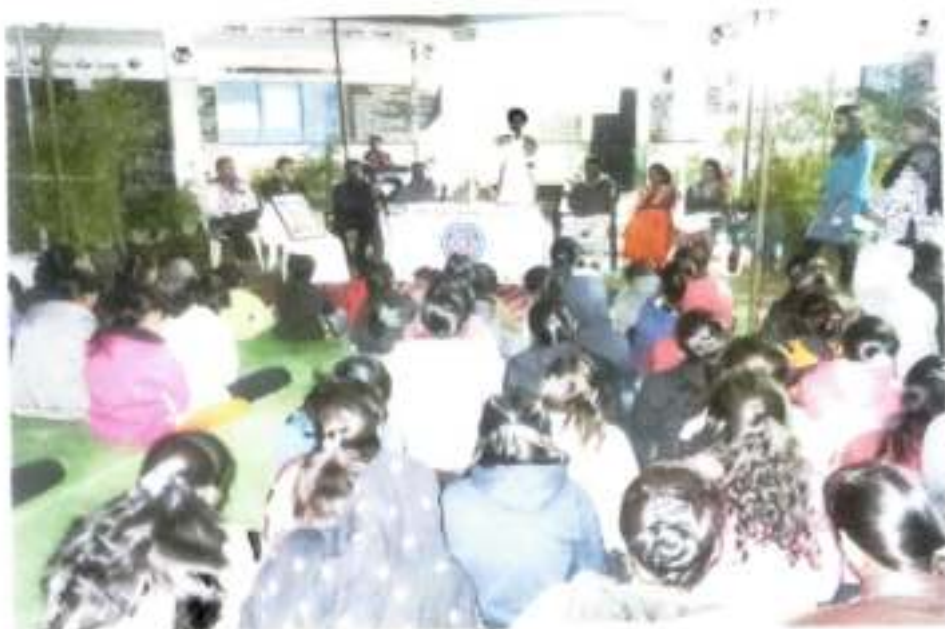
Chief Guest's address