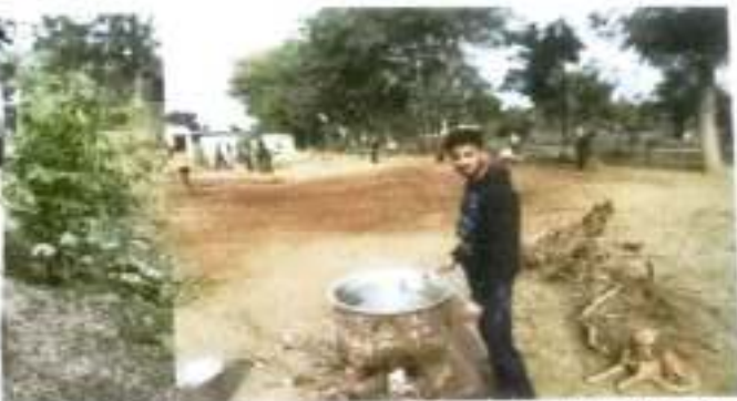
Shram-parishram Committee in action.