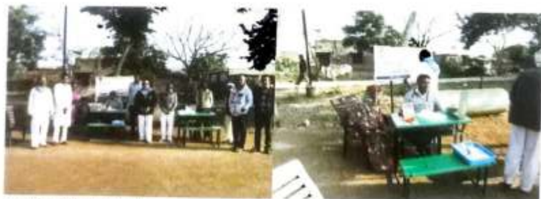
Medical Checkup Camp

A medical checkup camp was organised by Satyasai Sewa Sanghatna, Wardha .