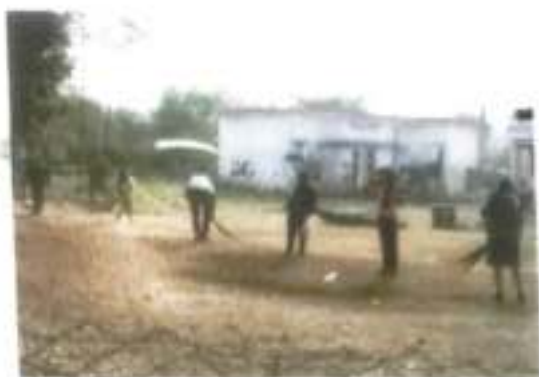
Food Committee preparing for lunch Cleanliness Committee in action