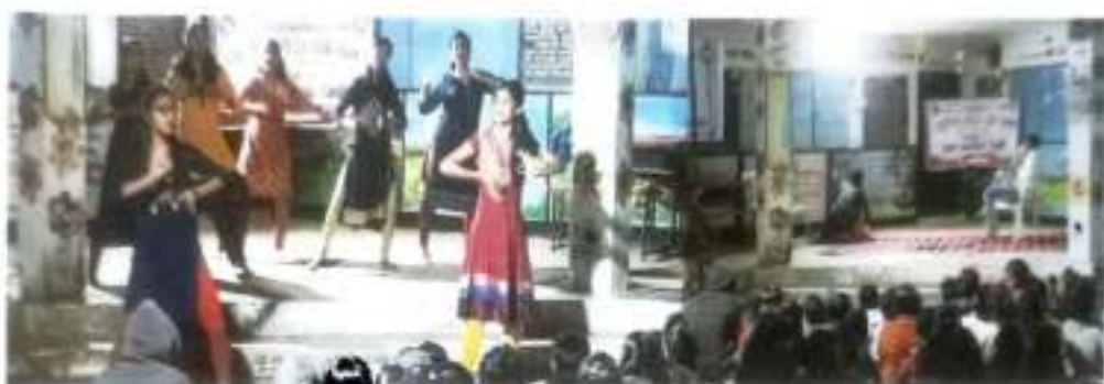
Girls' dance performance.