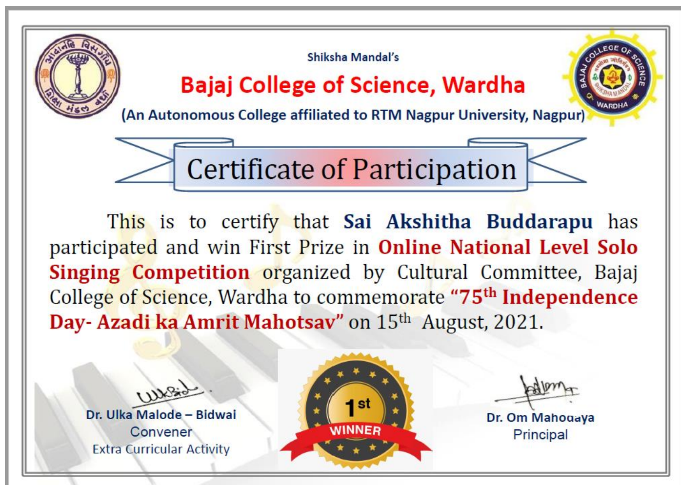
Glimpses of Online National Level Solo Singing Competition held on 15 th August 2021.