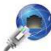
High Speed Internet in ICT Center