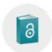
Access to library Stacks

Explore our campus via google earth: https://goo.gl/XtYLby