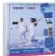
Sanitary Napkin Vending Machine & Incinerator