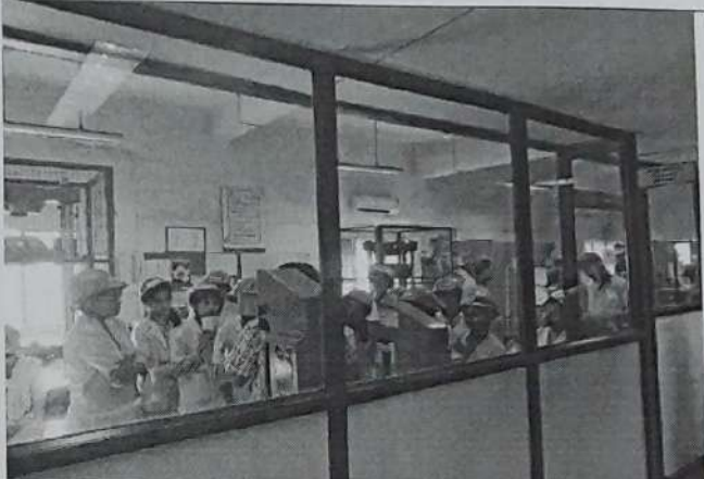
Demonstration of Physical Lab. Instruments