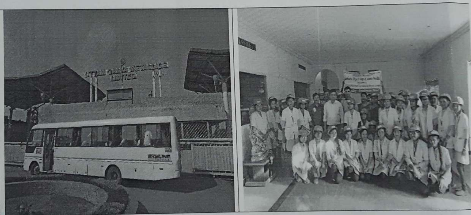
Visit to Uttam Galva Metallics Limited, Wardha

This tour enriched the knowledge of students about Industry and working of various sophisticated Instruments.