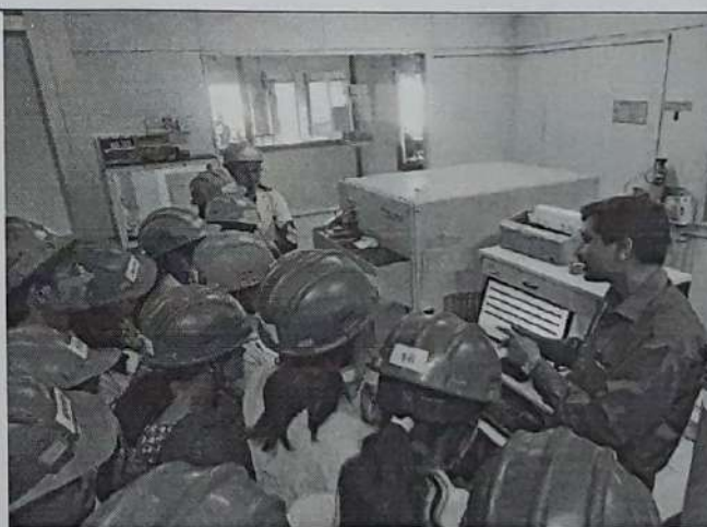
Demonstration in Chemical Lab. and Spectra Lab.