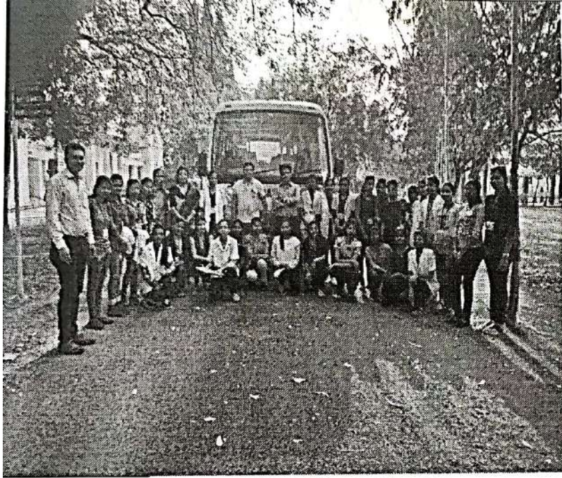
Group photo in college campus