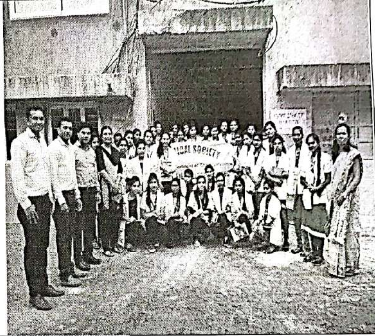
Group photo in Bajaj Superpack India Ltd. Na