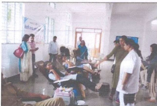
Blood Donation Camp organized by CWSS

CWSS students voluntarily participated and donated blood in Blood donation camp , Students haemoglobin was also measured . This programme was organized by Alumni Association of JB and Rotary club, Gandhi City, Wardha on 22nd September 2018 at J. B. College, Wardha.