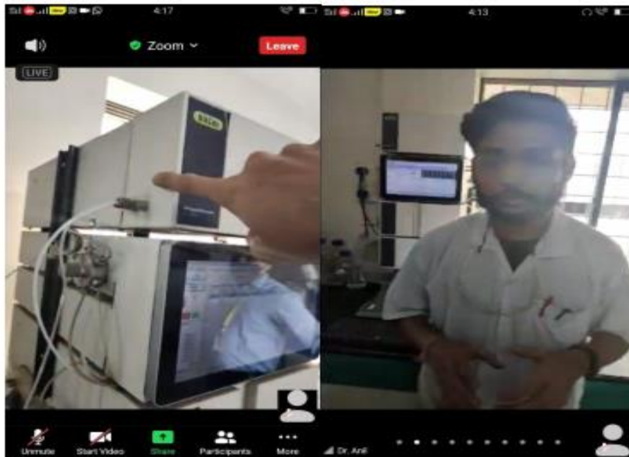
Virtual Industrial Visit at Cleantech, Mumbai