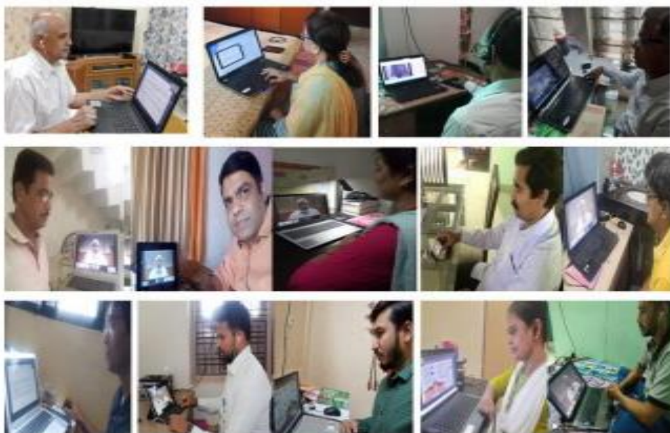
Faculties of Bajaj College of Science, Wardha attending the online session on “Why IP is important in academia?”